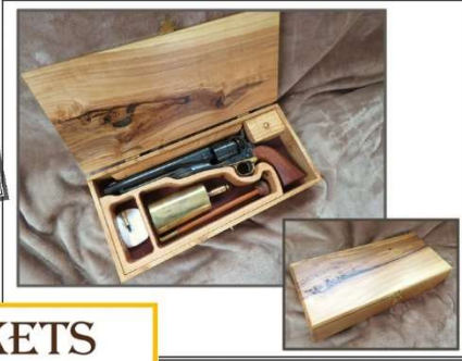
Replica 1860 Army Revolver with handmade wood case & accessories